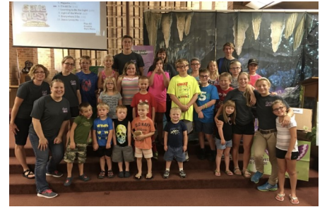
This is the first picture I took, on my first day of Sunday School as Christian Education Director in 2015.

Thank you. As I continue to receive and open congratulatory cards and am working on getting thank you cards written and sent out, I reflect upon our time together in ministry. Your support and prayers throughout the years have meant so much to me, and I would not be the leader that I am today without them. The journey that started with you all in 2011 is held close to my heart; ski trips, youth gatherings, Sunday school, confirmation, Christian education board, stole making, filling backpacks, assisting in worship, assisting with Kingdom Company, vacation bible school, Sunday night youth group, and the list goes on. All of these spaces were provided with your love and guidance; I treasure all of the learning, laughing, and lessons. It has been an honor to have been invited to walk with so many of you in your faith journey, questioning, challenging, learning, and growing. We did this together as brothers and sisters in Christ.